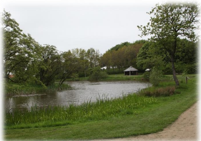
The town park and lake